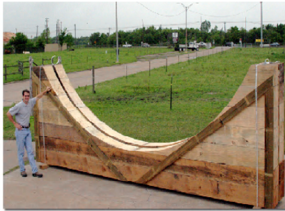
Tank & Vessel Saddles