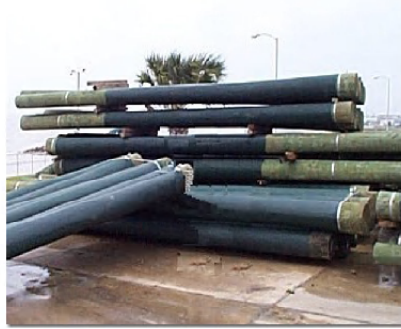
Polymer Coated Wood