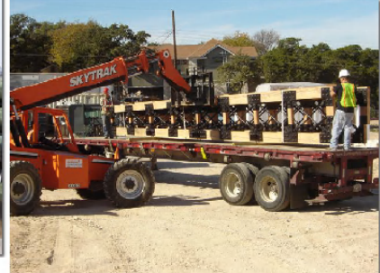
Structural Timber Trusses