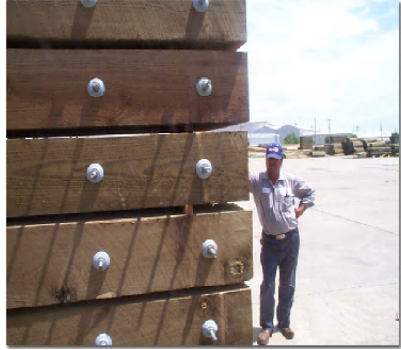
Marine Fender Systems