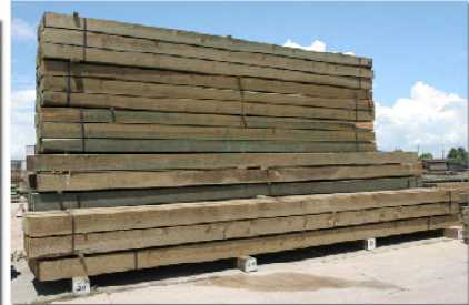
Over-Sized Timbers & Pilings