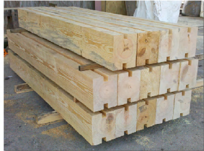
Stop Log Components