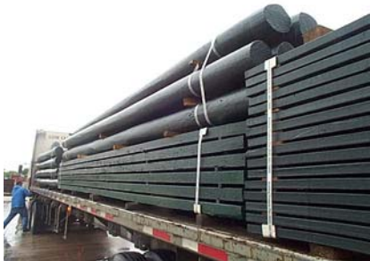
21 POLY Polymer Coated Piles Amazing Longevity

Northstar Vinyl is engineered and 3 rd party-tested for strength and durability – resists UV rays.