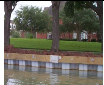
Residential Development Northstar Vinyl Bulkhead