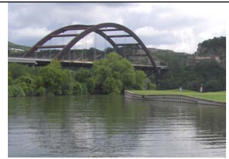
Country Club Bulkhead