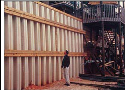
Commercial Northstar Vinyl Seawalls & Retaining Walls