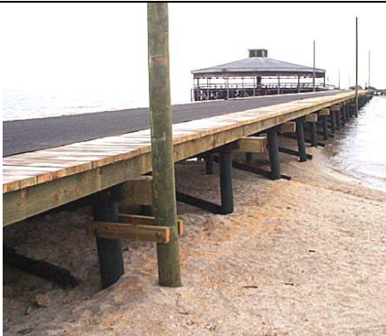
21 POLY Coated Pilings & Posts