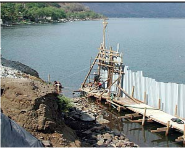
Commercial Northstar Bulkhead in El Salvador