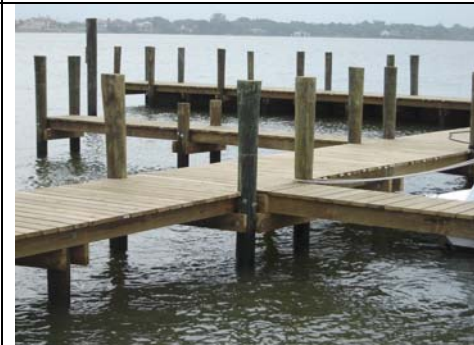
Treated Dock & Pier Materials