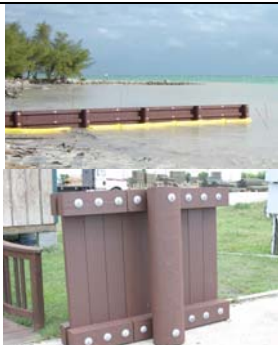
21 POLY Coated Wave Break