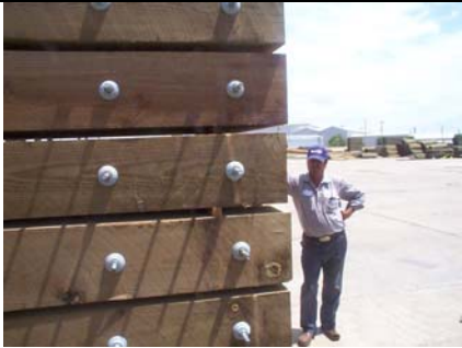
Shipping Port Fender Systems